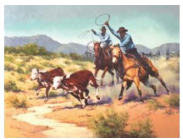
Harold Lyon, The Great Escape, oil on canvas, 36" x 48".

Don't be concerned about too much art. It's fun to take down pieces and replace them with something else, then bring them out and hang them In a different location to see them in a different light or context. Go ahead and play curator with your collection.