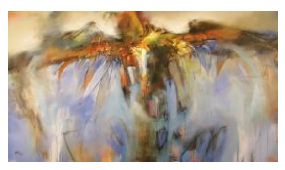
Blu Smith, Eagle Perch, mixed media, 54" x 96".

Don't hesitate to visit galleries often — they're free. It's one of life's great pleasures. And if you see something you like, ask the staff whether you can try the painting at home before you commit. Layaway possibilities are also worth asking about.